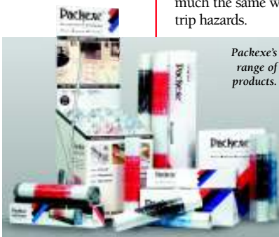
Packexxe's range of products.

For more information on the company's range of products and services circle readerlink 114