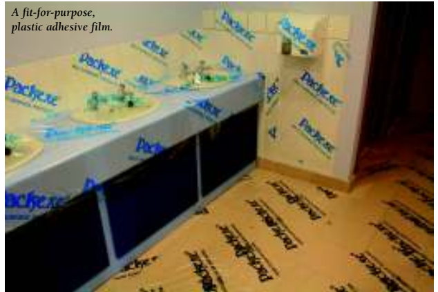
A fit-for-purpose, plastic adhesive film.

Builders and decorators using clear, unlabelled adhesive films to protect surfaces, floors and windows may be causing themselves more problems than they solve. PBM looks at how cheaper, so called 'all-purpose' films can be a false economy.