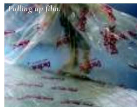
Pulling up film.

days or months depending on the quality of the film. With clear, unlabelled 'all-purpose' film the user has no idea how long it can be left in place before this happens. Other important factors such as slip-resistance and fire-retardance are equally uncertain when the film is supplied as an anonymous unlabelled roll on the builders' merchant's shelf.