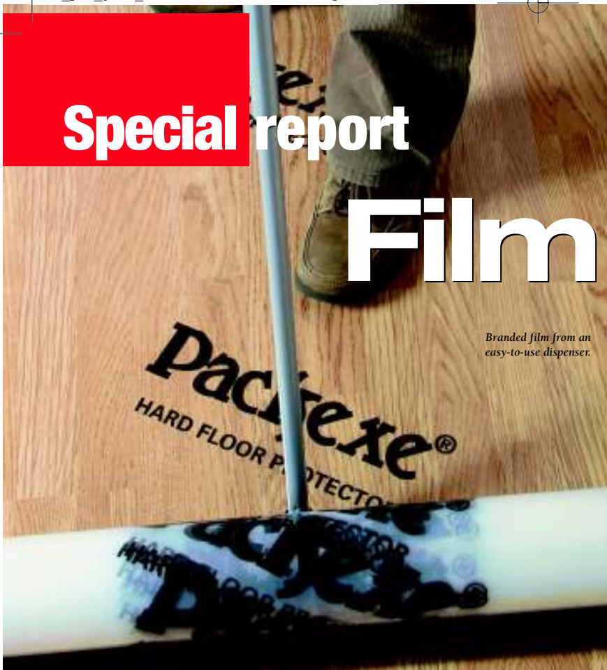
Branded film from an easy-to-use dispenser.